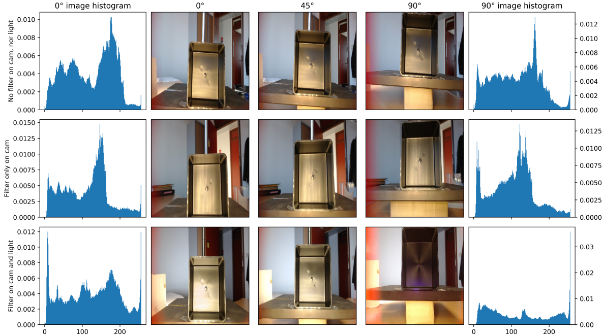
Figure 2: The same part in three datasets: raw images polarized or not.