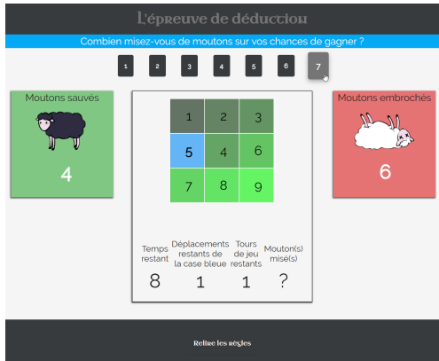
(a) Logical game