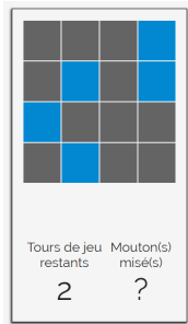
(b) Sensory game