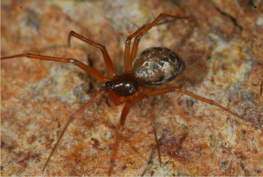
Figure 5. doi

Tenuiphantes miguelensis (Wunderlich, 1992).