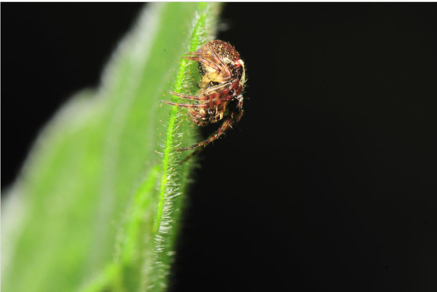
Figure 6. doi

Tenuiphantes miguelensis (Wunderlich, 1992).