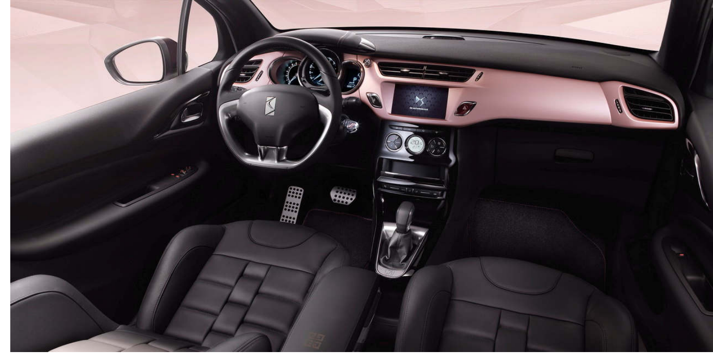
Pink Dashboard of the Citroen "Ds The MakeUp" feat. Givenchy, 2016