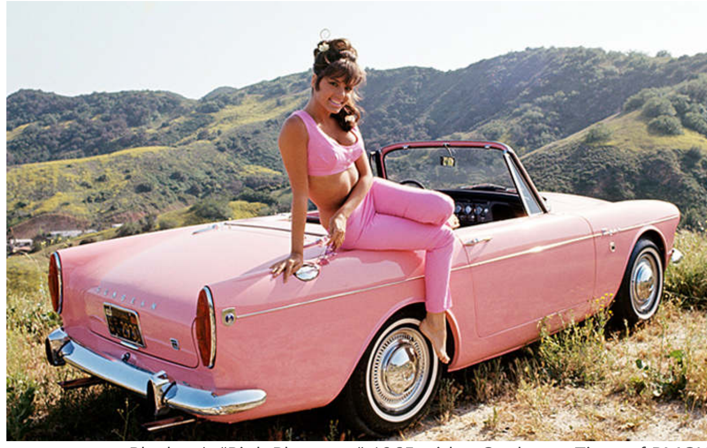
Playboy's "Pink Playmate" 1965 with a Sunbeam Tiger of PMOY