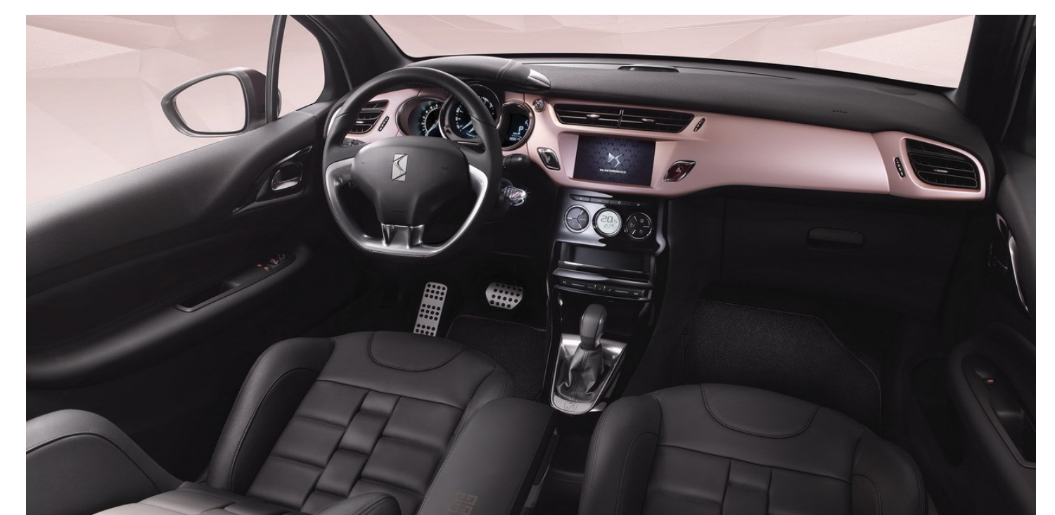
Pink Dashboard of the Citroën "Ds The MakeUp" feat. Givenchy, 2016