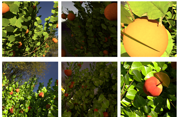
Figure 1: Samples of synthetic oranges (top) and apples (bottom) with different lightning conditions and rendering qualities.

It mainly contains a animation loop, such as that each time-step is responsible for the rendering of one image (and a semantic segmentation map, corresponding to the ground truth label), different from the previous ones.