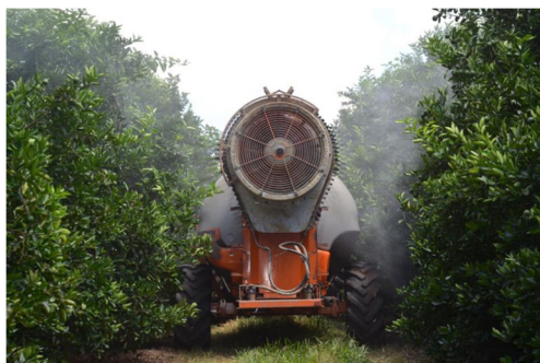
Fig. 3 Application of copper-based antimicrobial compounds on citrus trees in Brazil. While there are reports on the development of Cu resistant strains of Xanthomonas citri subsp. citri , the causal agent of citrus canker, from Argentina and France (Table 2), there are no such records in Brazil. Consequently, judicious use of these compounds have become an important component of integrated pest management to reduce the pathogen population development

strains when Cu-resistant strains thrive in the same environment (Sundin et al. 1989).