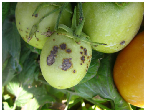
Fig. 4 Tomato fruit surfaces showing residues of copper-based antimicrobial compounds (light green spots) used to contain the build-up of bacterial populations on plant or fruit surfaces. The lack of timely application of these compounds, however, did not control bacterial spot, caused by Xanthomonas perforans , with heavy disease symptoms on tomato fruits (black spots). Tomato fruits bearing such disease symptoms are not marketable given their reduced esthetic values

During the last two decades, more effective use of Cu has been achieved based mainly on monitoring and forecasting systems (Van Zwieten et al. 2004). In particular, choice of optimal application timing, advanced spraying technology, and advanced formulations of Cu fungicides have led to more efficient use of CBACs. In addition, evidence that effective disease management can be achieved also with low amounts of Cu has encouraged growers toward a sparing use of these compounds, which is profitable for growers in terms of costs related to the product and application. Reduction of Cu concentration would lower the risk of phytotoxicity, which is