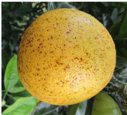
Fig. 2 Characteristic symptoms of phytotoxicity due to copper-based antimicrobial compounds on citrus fruit surface. Such a visible damage on fruit surface markedly reduces the esthetic value of the fruits thereby compromising their marketability

High levels of Cu in agricultural soil may cause plant stress and reduce soil fertility having adverse effects on crop yield and quality (Dumestre et al. 1993). Copper compounds release Cu ions when they are dissolved in water and thus an excessive uptake of Cu ions by plants at any time may lead to damage, also known as phytotoxicity (Fig. 2). Many factors might lead to Cu phytotoxicity on plants, including the application of highly soluble Cu formulations (e.g., copper sulfate, copper nitrate) or excessive amounts (either too high application rate or too frequent applications), use of acidic spray solution (pH below 5.5) which results in excess soluble Cu, tank mixing of Cu with other products, application of Cu at high temperatures, dry weather and presence of impurities in the product (Timmer and Zitko 1996; Behlau et al. 2017). In addition, wet plant canopies, due to a high humidity of the environment, favor a continuous release of Cu ions with consequent phytotoxic effects. Finally, the application of CBACs at certain plant stages may cause phytotoxic effects as many plants are sensitive to Cu compounds even at lower concentration (e.g., during flushing or blooming; Renick et al. 2008). Overall, many perennial fruit tree crops express frequent symptoms of Cu phytotoxicity, especially when they are at the blooming phase, compared to annual crops. For instance, phytotoxic effects of Cu have been observed on tomato, apple