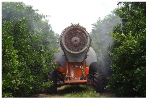
Fig. 3 Application of copper-based antimicrobial compounds on citrus trees in Brazil. While there are reports on the development of Cu resistant strains of Xanthomonas citri subsp. citri , the causal agent of citrus canker, from Argentina and France (Table 2), there are no such records in Brazil. Consequently, judicious use of these compounds have become an important component of integrated pest management to reduce the pathogen population development

strains when Cu-resistant strains thrive in the same environment (Sundin et al. 1989).