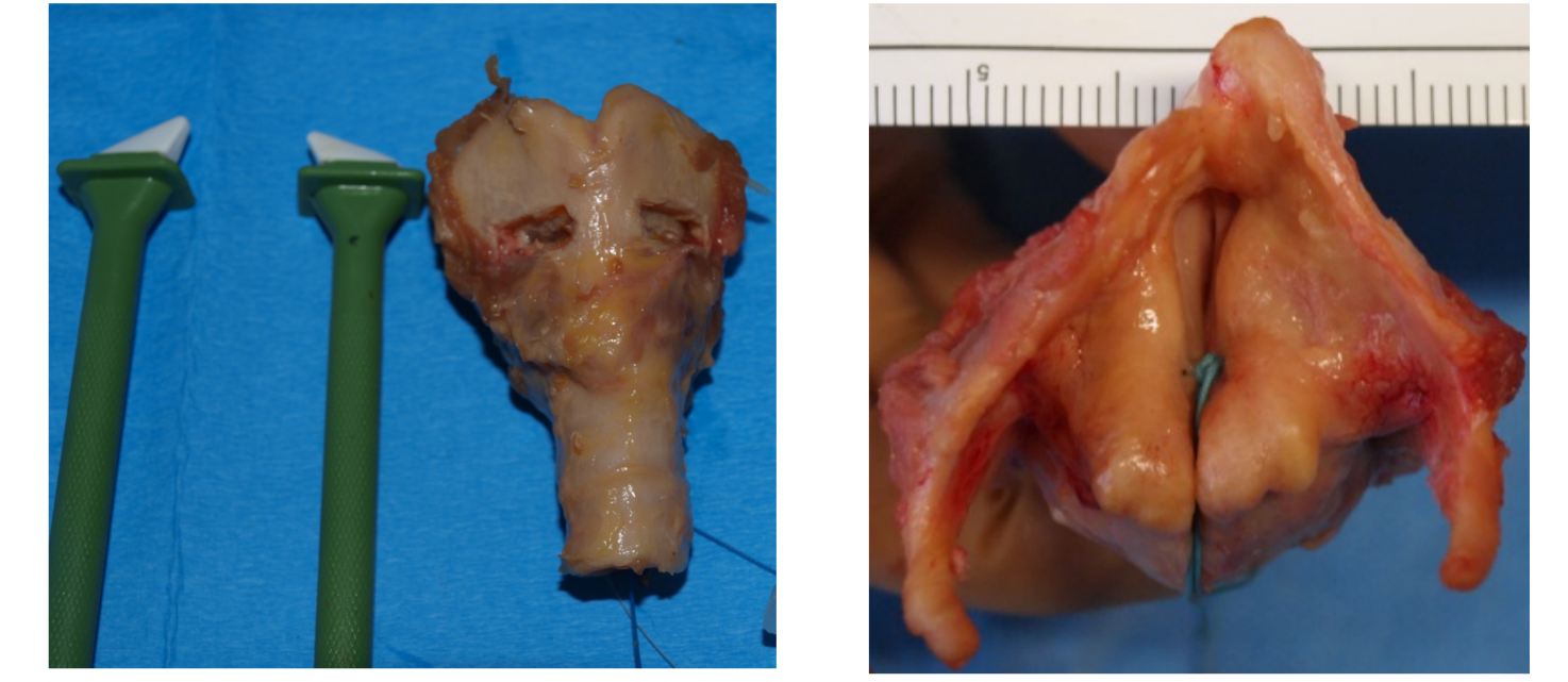
Fig. 1: Pre-phonation configuration

The phonotraumatism is a complex mechanism. Collision force between the vocal folds is only one component of it [1]. Information about its relation with other aerodynamic, acoustic and electroglottographic parameters is still lacking.