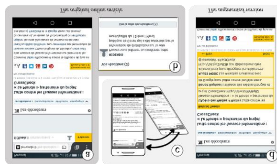
Fig. 2. The original mobile Web site and the augmented version

Wayra is reading about “CrossCheck”(a), but the article has just two comments at the bottom of the page (b). She wants to read more opinions so, in this kind of situation, she used to copy the title, open a new tab, visit Twitter and perform a search using the copied text as keywords. However, this process became tedious for her and she eventually stopped doing it. She would like to retrieve tweets in the same context of the article easily. Besides, the extra interactions make her feel uncomfortable to perform it with a single hand, and she would like to use single-handed tilting gestures to show and hide an extra section with related tweets at the top of the article, as in steps “c” and “d”.