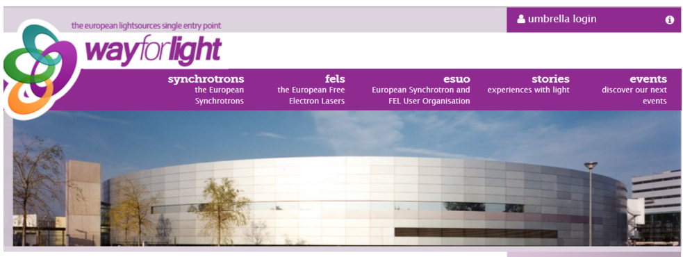
You are in: Home / Synchrotrons / BESSY II

Information about the facility (access provider).