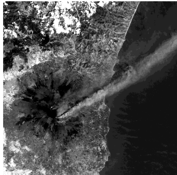
Figure 2. SPOT image of Mt. Etna flank eruption, 20 July 2001.

Their method practically multiplies the number of possible repeat-time measurements, opening the door to infra daily, high resolution, volcanic cloud height monitoring from space. In this study, we apply the method developed for Landsat-8 in de Michele et al. (2016) to the CNES SPOT1-5 family on the Etna 2001-2002 flank eruptions (figure 2). Given the high resolution of the input images (from 5 to 10 meters), we practically extract Digital Elevation Models of volcanic plumes or Plume Elevation Models (PEMs, figure3). By using this SPOT legacy, we demonstrate the joint use of multiple satellite platforms to extract PEMs up to twice a day. This study is a hint for current available missions such as the Copernicus Sentinel 2.