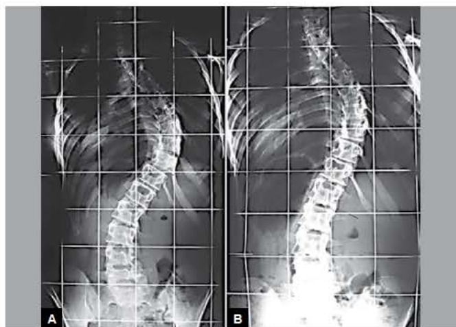
Figure 1. Radiographs of two twin sisters with concordant curve pattern, side and levels of ASV, apex and AIV. A, DM Curve; right/left; ASV T5, apex 9 and AIV T12/ASV L1, apex L4, AIV L5. B, DM Curve; right/left; ASV T5, apex T9, AIV T12/ASV L1, apex L4, AIV L5.

The study evaluated 243 pairs of individuals, 125 (51.4%) of which were concordant for the curve pattern and side of the deformity. Among these, there was a high concordance prevalence for the levels of ASV, apex and AIV: 91.2% (114 pairs).