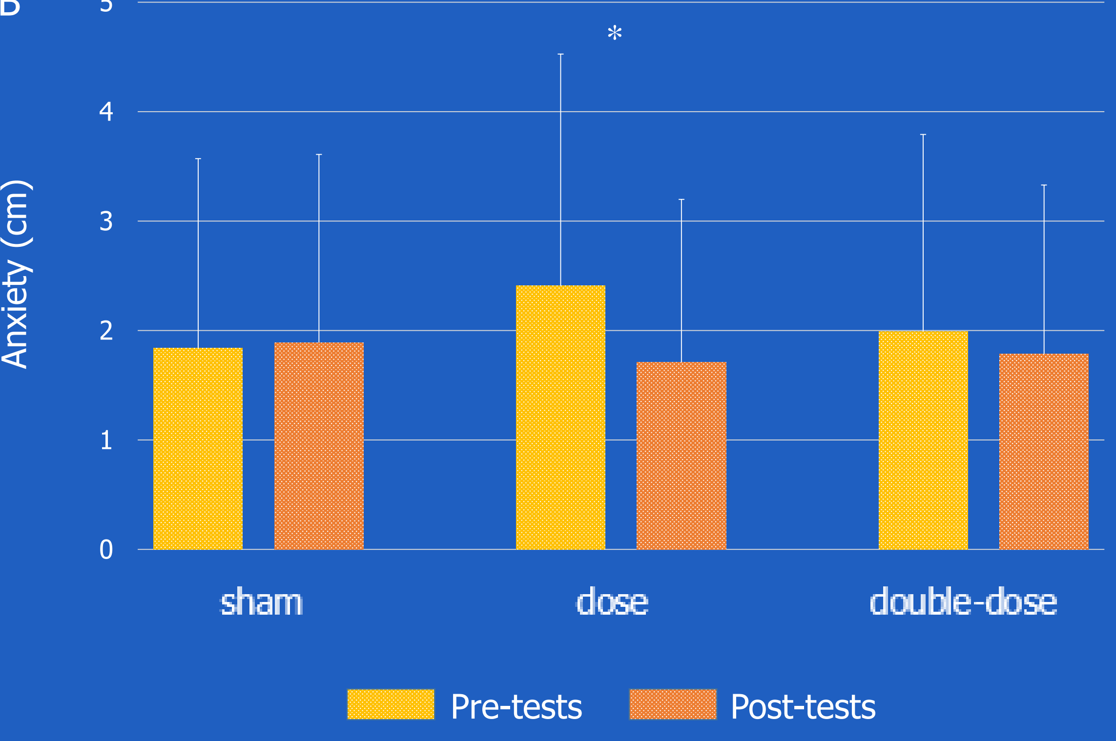
Figure 2: Representations of Graybiel scale score (A) and anxiety score (B) before and after each session. * : p < 0.05; ** : p < 0.01.