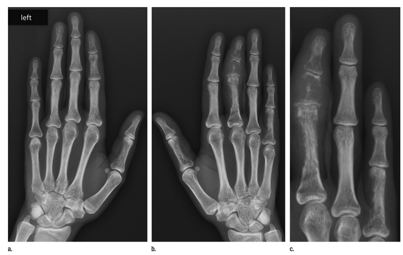
Figure 2: (a, b) Anteroposterior radiographs of the left (a) and right (b) hands. (c) Close-up view of the last three fingers of the right hand.