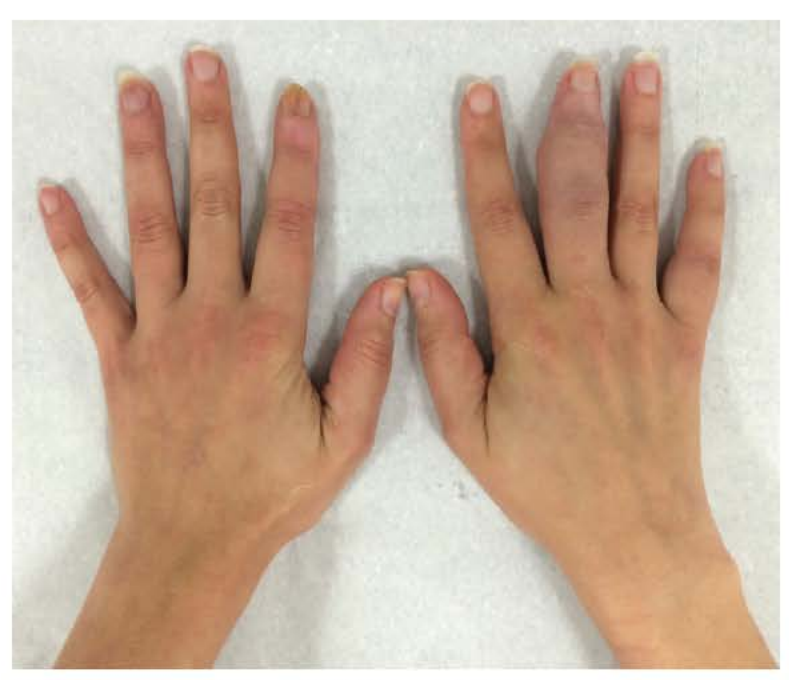
Figure 1: Photograph shows both of the patient's hands.

Submit the most likely diagnosis to http://rsna.org/dxplease (use only for submission of diagnosis). Select the case from the Active Case List for which you are submitting a diagnosis. Only one case, one name, and one diagnosis per e-mail submission. Multiple diagnoses and multiple submissions will not be considered. Deadline: Midnight U.S. Central Time, February 10, 2019. Answer will appear in the April 2019 issue. Authors wishing to submit cases for Diagnosis Please should first write to the Editor to obtain approval for the case and further information.