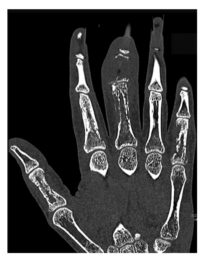
Figure 3: Coronal reconstructed CT image of the right hand obtained with the bone window setting.