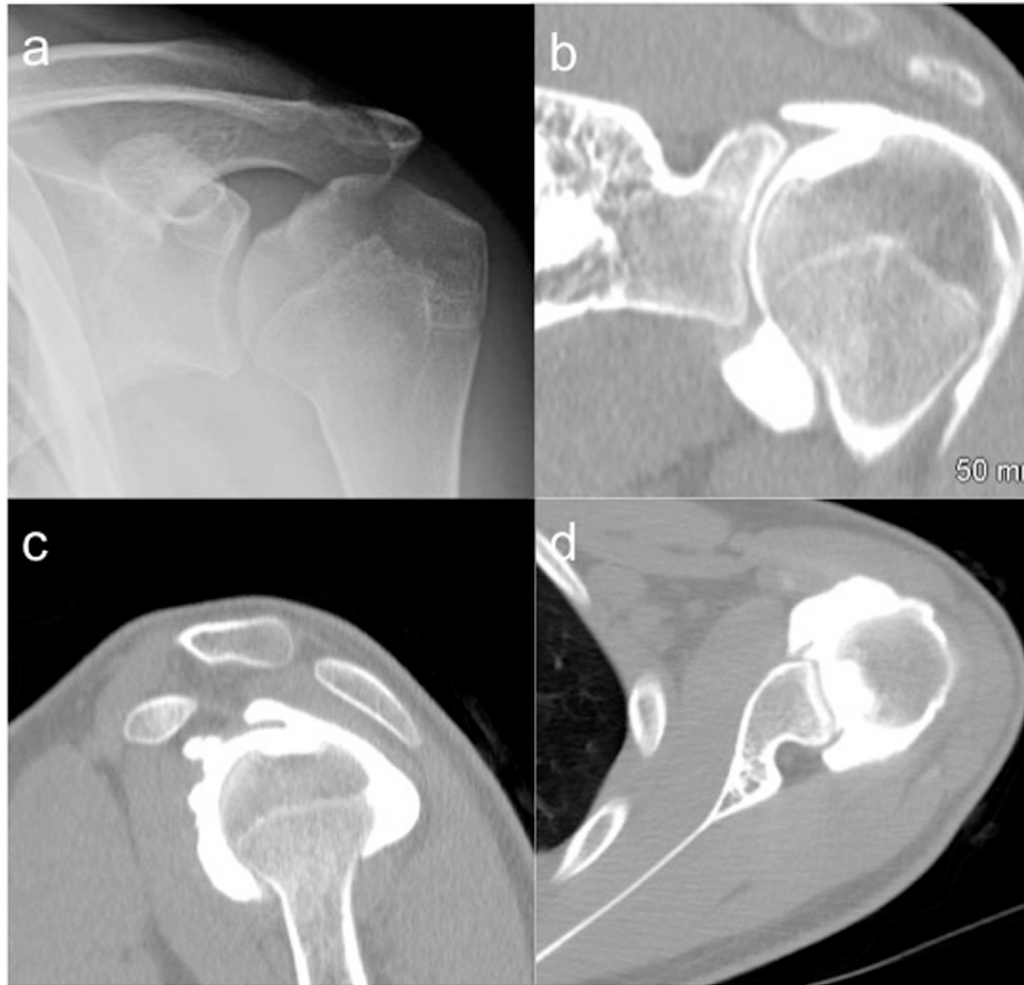
Fig. 1 Preoperative anteroposterior radiograph ( Fig. 1 A ) and CT arthrograms ( Figs. 1 B, 1 C, and 1 D ) of the left shoulder showing the osteochondral defect.

Next, a knee arthroscopy was performed using 2 standard anterior and 1 accessory medial parapatellar portals. The graft was harvested from the superomedial ridge of the femoral trochlea. A cylindrical core (10 mm in diameter and 15 mm deep) was obtained. Then, the recipient site in the humeral head was filled with the donor osteochondral graft from the knee. A level joint surface was obtained. The donor site in the knee was filled with the graft from the humeral head to prevent knee hemarthrosis (Video 1).