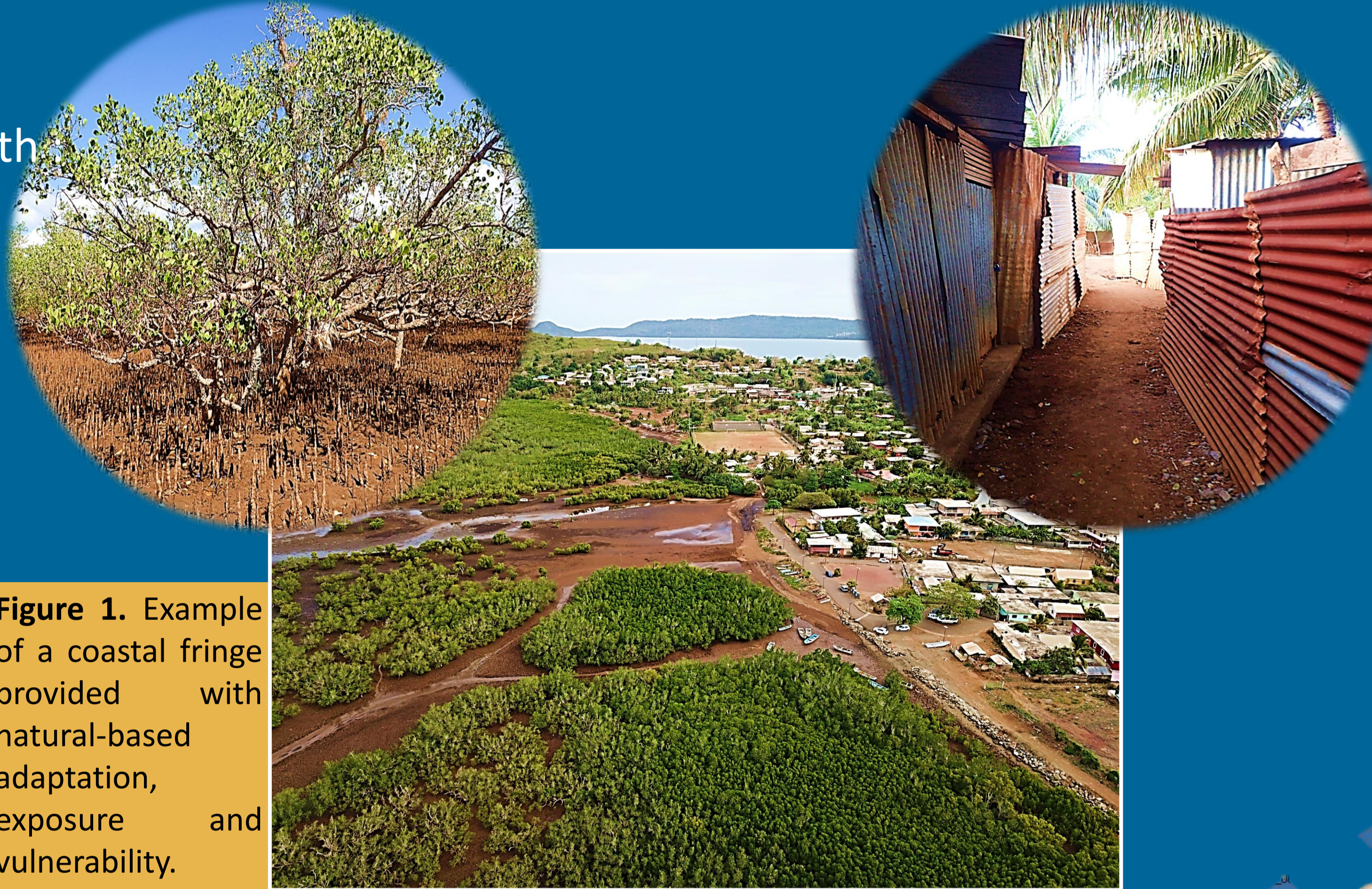
Figure 1. Example of a coastal fringe provided with natural-based adaptation, exposure and vulnerability.

Can an UAV map the structural complexity of intertwined coastal socio-ecosystems?