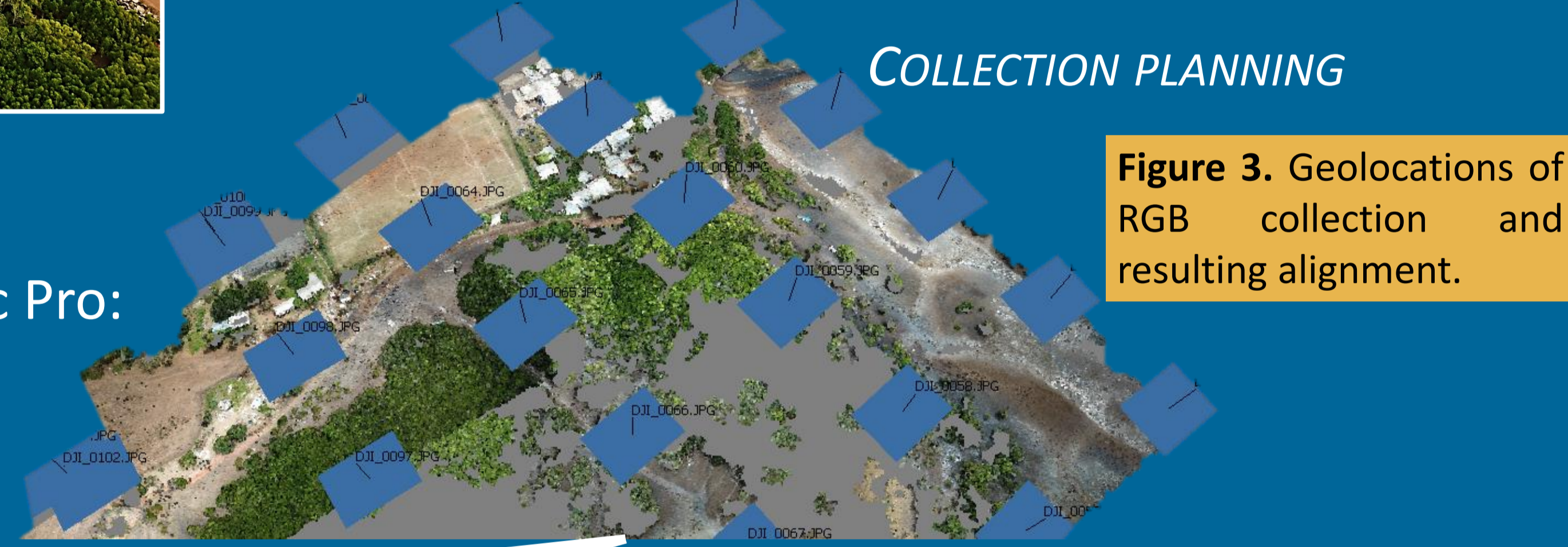
Figure 3. Geolocations of RGB collection and resulting alignment.