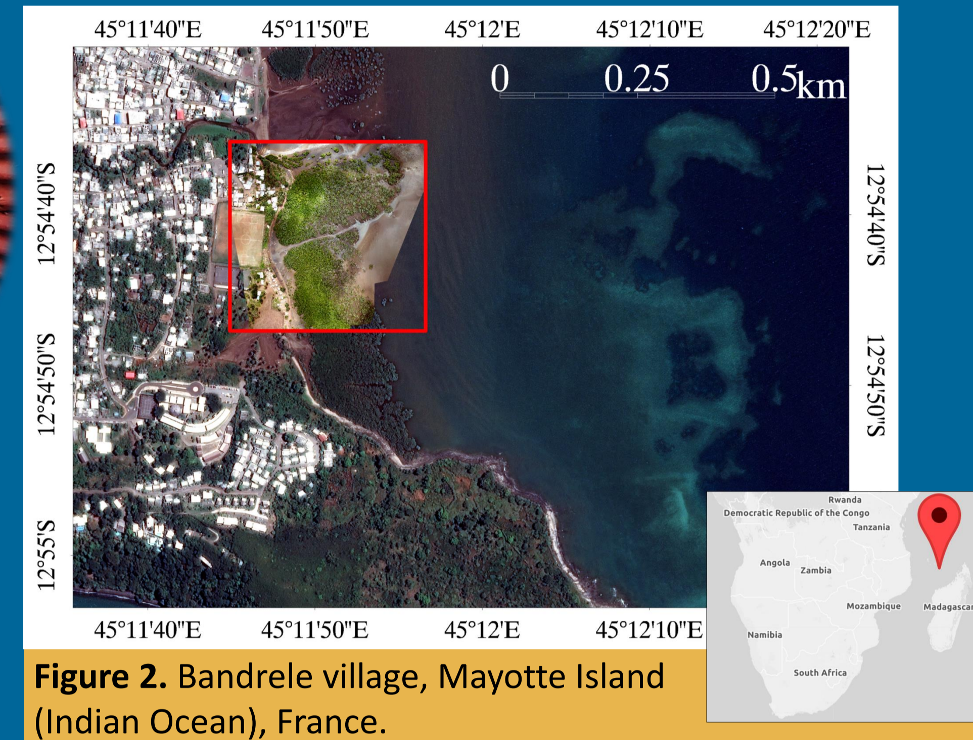
Figure 2. Bandrele village, Mayotte Island (Indian Ocean), France.