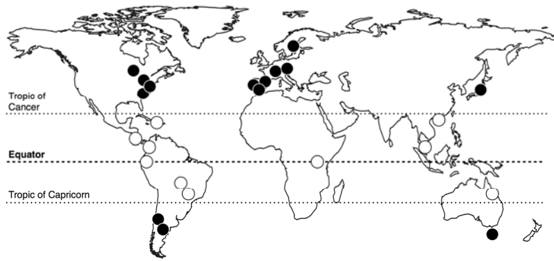
Figure 3. Location of 24 riparian litter collection sites; open and closed circles represent tropical and non-tropical regions, respectively. The map was created in the maps R package (Original S code by Richard A. Becker, Allan R. Wilks. R version by Ray Brownrigg. Enhancements by Thomas P Minka and Alex Deckmyn. (2016). maps: Draw Geographical Maps. R package version 3.1.1. https://CRAN.R-project.org/package=maps ).

Scientific Inc., Waltham, MA, USA). To determine P concentration, we acidified the remaining 20-mL aliquot with 1 mL of concentrated HCl, added deionized water for a final volume of 100 mL, and filtered the resulting solution through a Whatman GF/C filter (Whatman, Maidstone, UK). P was determined on the filtrate by the molybdate-blue method, and absorbance was measured at 880 nm on a Jenway 6715 UV/Vis spectrophotometer 58 . Additional leaves were rehydrated and ten 12-mm diameter discs were cut with a cork borer; the discs were then oven-dried at 45 °C for 48 h and weighed to determine SLA as the ratio of disc area (cm 2 ) to leaf dry mass (mg).