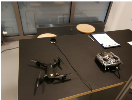
Figure 5: Study setup. During the study, the participant sat in front of the 3-D mouse and had to control a simulated flight.

Even though there were only a small number of participants, the results show a trend about the users' intuitive understanding of the controller and the natural mapping.