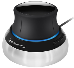
Figure 3: The device SpaceMouse® Compact from 3Dconnexion [1] was used for our exploration.