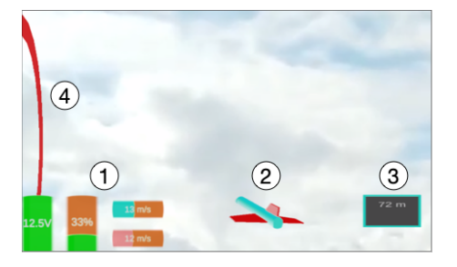
Figure 4: View from the security pilot with "Where is My Drone". 1) Gauges indicating the power and battery level, the air speed and the ground speed. 2) 3D model displaying the drone attitude 3) Drone's altitude and climb gradient. 4) The localization ring that helps finding the drone.