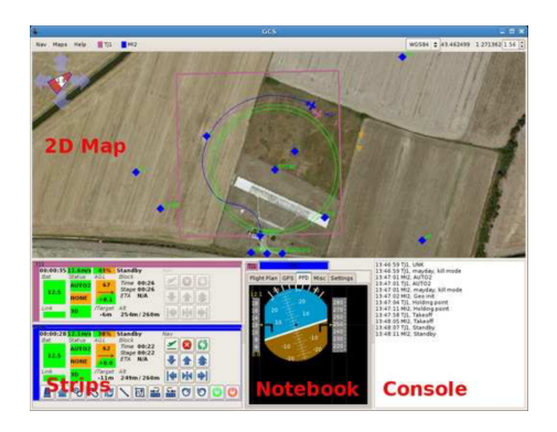
Figure 3: Ground Control Station Graphical User Interface [10].