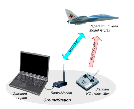
Figure 2: Paparazzi System overview [10].