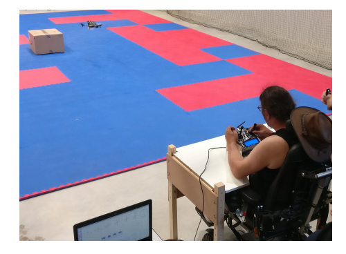
Figure 8: P4 trying landing the drone on a box [9].