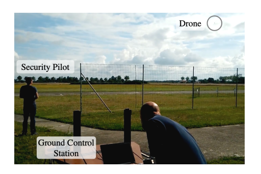
Figure 1: Flying drones outdoor with Paparazzi.

© 2019 Creative Commons CC-BY 4.0 License.