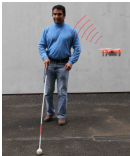
Figure 3: The sound of a drone is capable of guiding visually impaired.

The power potential of the motors limits the payload and can negatively impact the quality of force feedback. This can affect that a user cannot feel the drone dragging their hand [6] or that the level of resistance the drone can provide is not enough to stop the pushing of the users' hand [5].