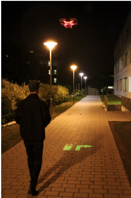
Figure 2: A pedestrian receives navigational instructions by a projector attached to a drone.

attached actuator to nudge the users and therefore simulate feedback for bumblebees, arrows, and other objects hitting the user, while the user is visually and acoustically immersed in VR.