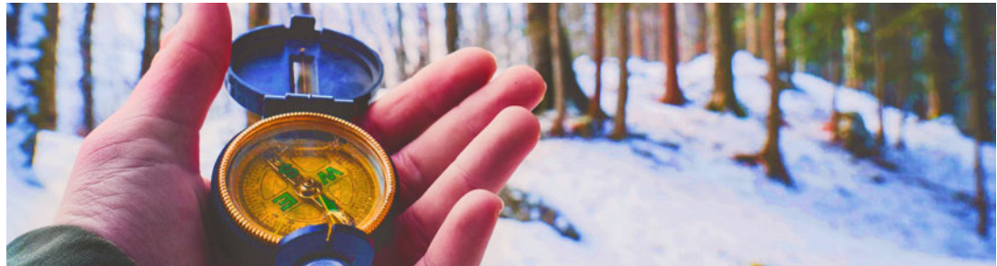
Figure 1: A traditional search and rescue scenario in a secluded area, without any connection to the outside world.

Sven Mayer 1 , Lars Lischke 2 , Paweł W. Woźniak 3