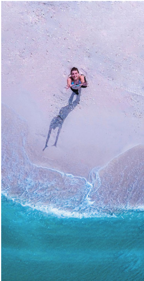
Figure 4: Search and rescue at a beach with communication by gestures.