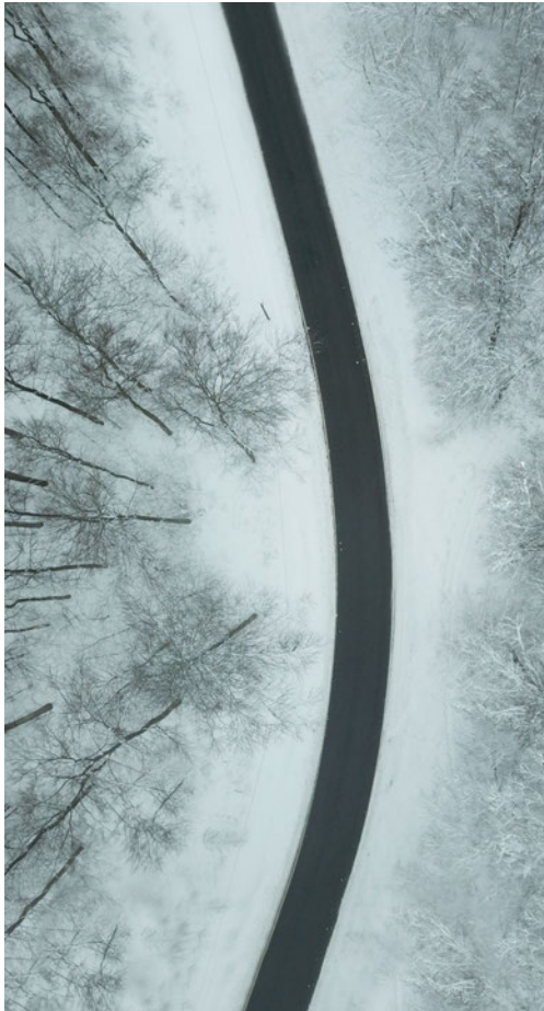
Figure 2: Drone overfly of a remote path in a forest.