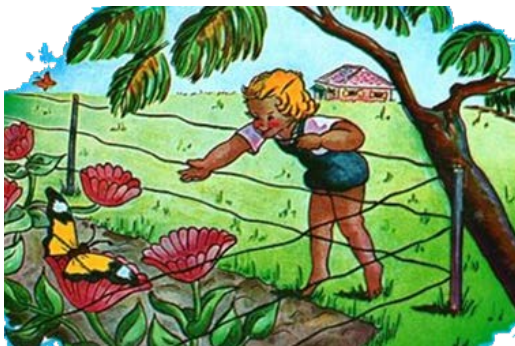
Figure 2: From the cover of Fania Bergstein's "Come to Me Nice Butterfly" [6]

From: "Come to Me Nice Butterfly", by Fania Bergstein (translated from Hebrew [6])