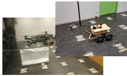
Figure 4: SLAM supplemented with tags

adaptive dialogue between the Soundpainter (here is the pilot) and the group, enabling contextual interpretation by each individual, and generating rich interaction and dialogue. The grammar used in Soundpainting is a set of gestures classified in four subsets: Who , What , How and When . A gesture Who indicates who is chosen by the Soundpainter. A gesture What indicates what Soundpainter wants to be done (e.g., hold a note). A gesture How indicates how Soundpainter wants the action to be done (e.g., in the case of sound, loud, fast or high). A gesture When indicates when the Soundpainter wants the action to start and/or stop. The expressive power of the Soundpainting language in the context of controlling the movements and the sounds of drones was shown in [7].