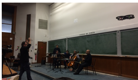
Figure 5: A rehearsal of the opera with drones and musicians directed by a Sound-painter

an issue in some situations and requires a lot of calibration to adapt to a given environment. In case the environment is not adapted (because of bad lighting for instance) the system can be augmented with external tags. We have experimented this approach in our Green Sword use case that consists in cleaning a green park with a swarm of air and ground vehicles and we obtained a correct location, even though not as good as what we had with motion tracking.