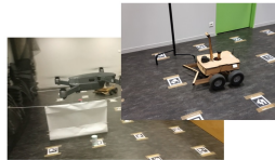
Figure 4: SLAM supplemented with tags

adaptive dialogue between the Soundpainter (here is the pilot) and the group, enabling contextual interpretation by each individual, and generating rich interaction and dialogue. The grammar used in Soundpainting is a set of gestures classified in four subsets: Who , What , How and When . A gesture Who indicates who is chosen by the Soundpainter. A gesture What indicates what Soundpainter wants to be done (e.g., hold a note). A gesture How indicates how Soundpainter wants the action to be done (e.g., in the case of sound, loud, fast or high). A gesture When indicates when the Soundpainter wants the action to start and/or stop. The expressive power of the Soundpainting language in the context of controlling the movements and the sounds of drones was shown in [7].