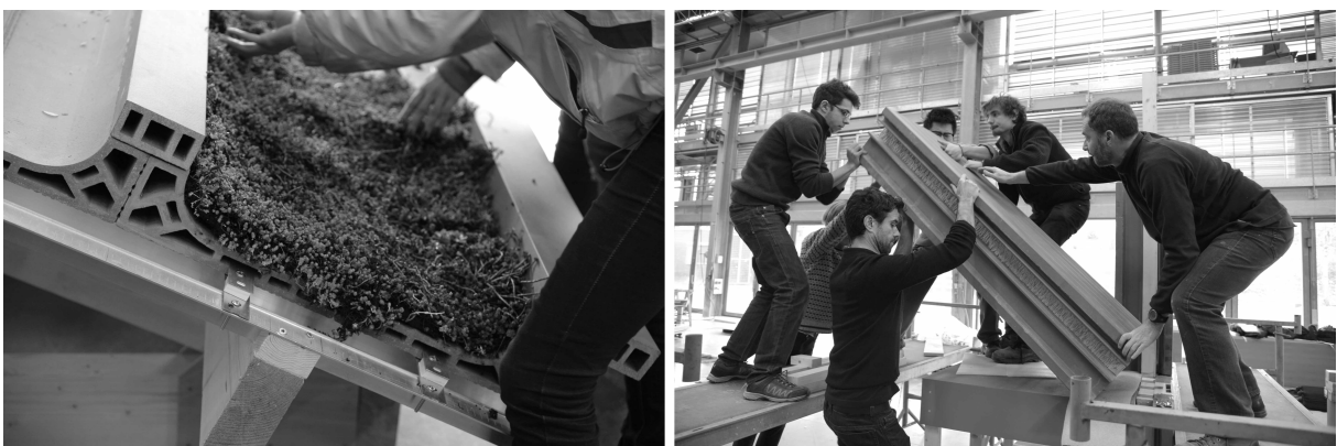
Prototyping of planted tiles and virtuous wall

This usable characteristic of the innovation [demonstrated by the prototype] is one of the conditions to register the patent. The national public agency of intellectual property defines as patentable criteria the new technical solution to a technical problem and the practical use for industry 1 .