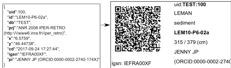
Figure 2: A label sample used for cores of sediments with the associated QR code.

The software is based on a barcoding method, using labels that are machine readable. We have designed a label containing a QR code that encodes the sam- ple's ID, but also encapsulates the descriptive information about context of the sampling (project, location, time, principal investigator, etc.) in a JavaScript 320 Object Notation (JSON) format. Using COLLEC-SCIENCE, the unique iden- tifier ( uid ) of the sample and the name of the database ( db ) are mandatory, but like shown on the Figure 2 you can choose to encode other important variables inside the QR code. Our point of view is that databases may be lost in the future due to technical deprecations, but encoded data in the QR code won't be 325 lost. For instance, the QRcode can contain the human defined sample identifier ( id ), the name of the project ( prj ) that has funded the sampling, the geographic coordinates ( x , y ) and the creation date of the sample ( cd ), the name of the Principal Investigator for this sample ( pi ). COLLEC-SCIENCE is also able to manage external identifiers, such as the IGSN, and thus you can paste it in the 330 QR code.