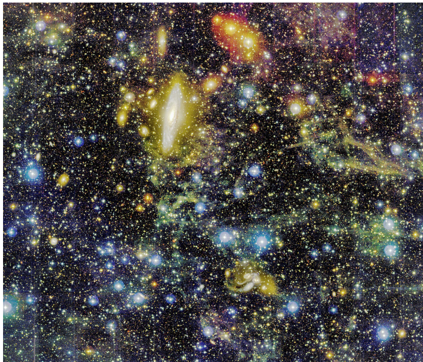
Figure 2. Composite u + g + r band image of the whole CFHT/MegaCam field, encompassing SQ (bottom right-hand panel) and NGC 7331 (top left-hand panel). The field of view is 70 \text{ arcmin} \times 60 \text{ arcmin} . North is up and east left. An arcsinh scaling has been used to enhance the LSB features.

tidal structures as initially suggested, among other hypotheses, by Arp & Kormendy (1972). Scattered optical light by dust clouds in the Milky Way hampers extragalactic studies based on deep images, as they mimic stellar streams. They however provide valuable information on the structure of the ISM at small scales, as emphasized by Miville-Deschênes et al. (2016).