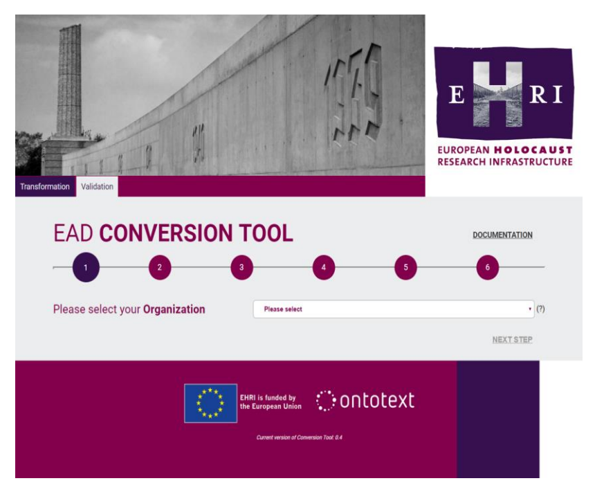
Fig. 1: EAD Conversion Tool, screenshot

would be EHRI's reply, struggling to establish sustainable connections and to avoid one-time one-off imports.