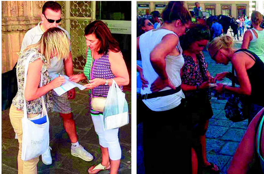
Figure 5. Tourist guides showing directions on a map by standing vis-à-vis in front of the tourist holding the map so that the latter can see the map in the right orientation. A second tourist takes a less active role beside them, thus creating a triangular formation.

possible to stand vis-à-vis in front of the person holding the map so that they could see (and read) the map in the right orientation, as shown on both images on Figure 5. A second tourist would often take a less active role beside them (e.g., not holding the map), thus forming a triangular F-formation. In this situation, although all three members have equal access to the physical space, their level of participation is unequal.