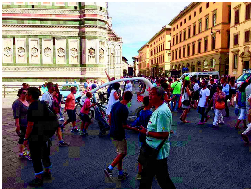
Figure 2. A wide variety of F-formation types could be found around every corner. People asking for directions vis-à-vis, resting on a bench back-to-back, side-by-side, in an inverted I-shape and lying flat. In the background, a family creates a circular formation on the stairs.