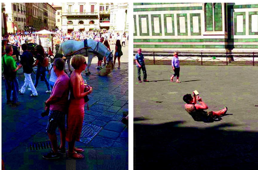
Figure 6. Unusual F-formations in the wild. A couple adopts a back-to-back formation to provide protection from potential pickpocketing (left). A person taking a photo from the ground to capture the entire Duomo (right).

We also observed some unusual formations that have not been previously reported in F-formation studies conducted in controlled settings. In addition to the aforementioned resting on a bench back-to-back, lying flat, and in an inverted I-shape (Figure 2), we also saw a standing back-to-back formation (Figure 6, left). Taken in isolation, this F-formation seems almost unnatural. However, video analysis showed the man on the left repeatedly touching his back pocket, checking whether his wallet was still there. Moments before this picture was taken, the man and the woman were standing at a 90-degree