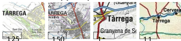
Fig. 1. A same geographic object may have very different representations across scales, as these settlement areas

Depending on the map scale and purpose, the level of abstraction defines the semantic level of detail with which the geographic space is described (Mackaness 2007). The transitions between maps with a different level of abstraction could be very disturbing for the user, as the visual changes are quite important. This way, the Figure 1 shows four different levels of abstraction for settlement areas: individual buildings, urban blocks, urban areas and city point symbols.