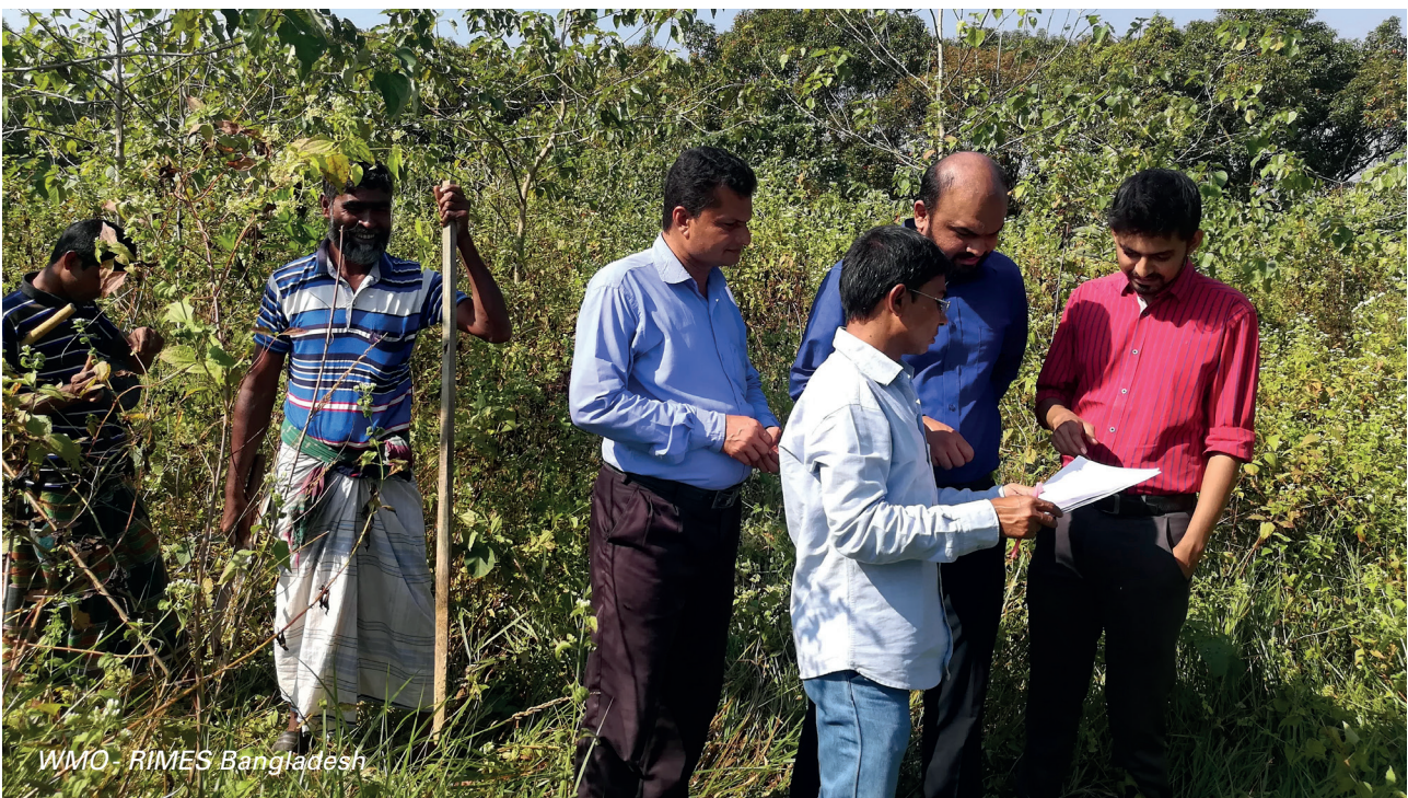
WMO - RIMES Bangladesh

WMO is mandate to preserve life and property by providing early warning systems for natural hazards. To improve such systems, it will implement an integrated Earth System approach and develop impact-based multi-hazard warning. It also has to address the technology and know-how gaps between its Members and find solutions for the many NHMSs with limited budgets and human resources – and a majority of staff nearing retirement who will leave a knowledge-gap behind them. Yes, the gap is not only spatial, between Members, but also temporal, between generations. Facilitating the inclusion and mentoring of talented multi-disciplinary young professionals – with the energy, know-how and skills to make connections between research and practice – is part of that solution.