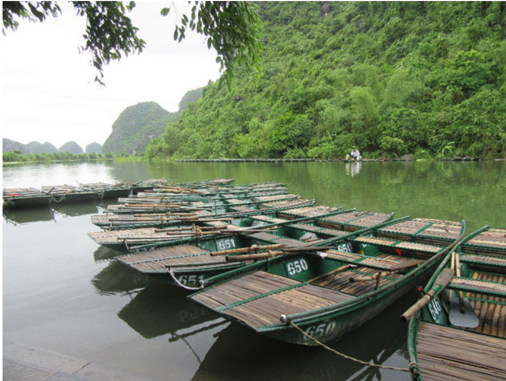
Fig. 9.4 Trang An Ecotourism Site: Service halted after tropical storm Mirinae in July 2016