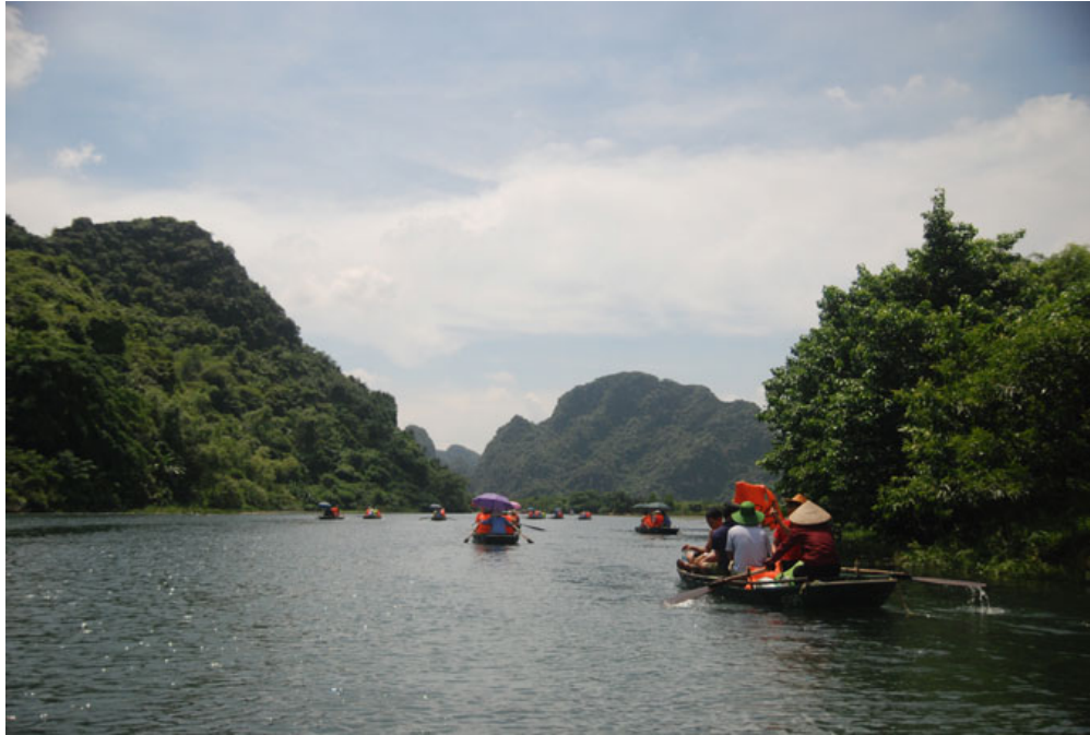
Fig. 9.3 Boat tours in Trang An

and economic changes. Climate variability has always been an integral concern for farmers. Rice crops are particularly sensitive to any change in climate and ecological condition, so rice cultivation is considered to be highly vulnerable to climate change (Komaladara et al. 2015; Matthews et al. 1997). In Ninh Binh, reports have increasingly appeared in the news about farmers losing their entire crop as a result of flooding or pests (Bao Moi 2010; Thai 2017; Vy 2016). These incidents seem likely to be associated with the overall temperature increase in Ninh Binh ( 0.08^{\circ}\text{C} in a decade), and residents' accounts of more extreme cold and hot days in recent years (Ninh Binh's Provincial People's Committee 2015a).