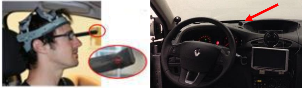
Fig. 1. Left: head-mounted display; right: remote display

Sensory interference should mainly occur for the R-DRT because the stimuli appears in the visual periphery, or entirely outside the field of view, as gaze is directed away from the location of the DRT stimulus [12]. The H-DRT should be less sensitive to sensory interference since the stimulus remains in the same position within the field of view [12]. However, if the eyes move relative to the head, the H-DRT is potentially sensitive to visual eccentricity, due to the reduced sensitivity in the visual periphery [12]. Thus, R- and H-DRT may potentially be used to capture specific related-effect of the visual display eccentricity.