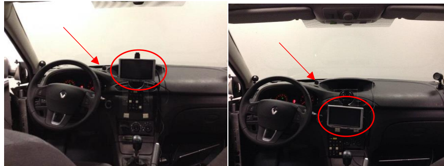
Fig. 2: experimental setting; display in high (left) and low position (right); arrow indicates localization of the remote stimulus for R-DRT

All tasks were performed with an interface located in high or low position (respectively 15° or 30° of visual angle below the view axis (see Fig. 2). Navigation entry and SuRT were expected to be more demanding in low than in high position.