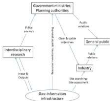
Figure 1. Communication links between key stakeholder groups made possible through a geo-information infrastructure

With this in mind, this paper proposes that a ‘geo-information infrastructure’, described here as the deep integration of GISystems and remote sensing into decision support and information management [see also 152], can help to rectify the information deficit surrounding