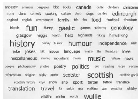
Figure 1: Word cloud on Scotster (July 27, 2016)

The word cloud of themes and tags on the forum (Figure 1) is generated by the platform itself, and it gives precious hints as to what is important to forum members. The size of each word depends on how frequent it is.