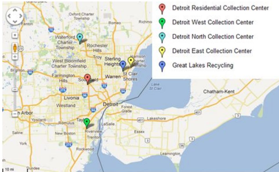
Figure 3: Map of Detroit Recycling Collection Centers and Great Lakes Recycling Center.