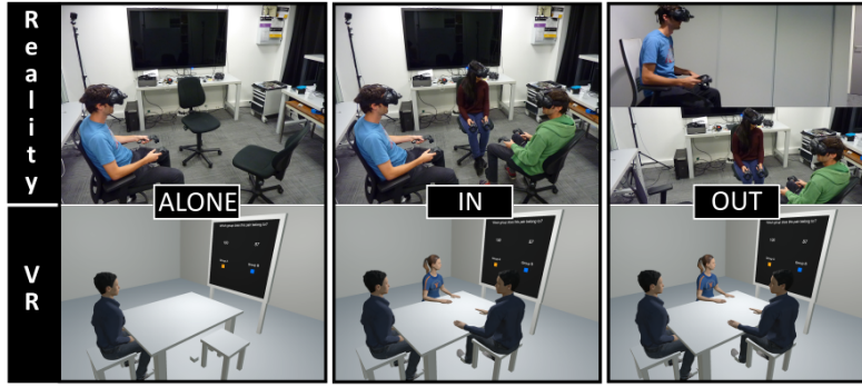
Fig. 1: Setup. User: (left) alone, (middle) audience colocated or (right) distant.