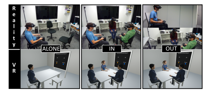
Fig. 1: Setup. User: (left) alone, (middle) audience colocated or (right) distant.