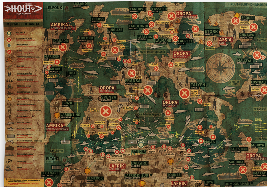
Figure 1 : Zineddine Bessaï, H-out: le guide de l'immigration (2010)

worms 3 . This expression emphasizes the fact that these individuals are ready to die trying to leave, and see this fate as preferable to rotting in Algeria.