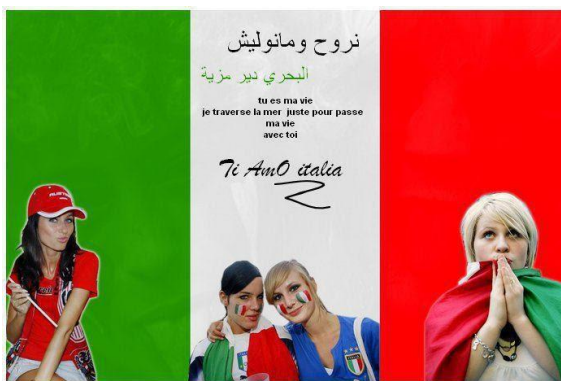
Figure 3: Facebook page “7ar9a”, posted on 10 December 2014

In one picture below, we see the colours of the Italian flag in the background. In the foreground is a collage of women supporters and three sentences written in different languages. In the Tunisian dialect, one can read, “I will leave and not come back. Sailor do a good deed,” referring directly to harga . In French, the phrase seems addressed to a loved one: “You are my life. I will cross the sea just to spend my life with you.” The last sentence, in Italian, is a message of love directed at a European country “I love you Italy”.