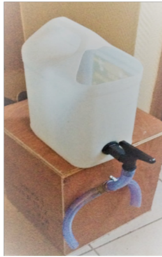
Figure 1: the water clock