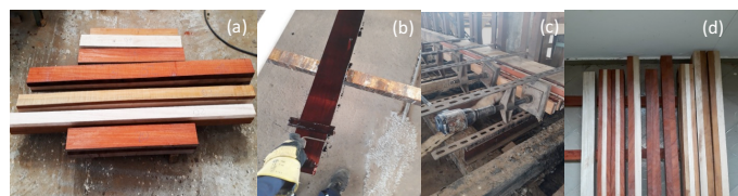
Figure 1. Gluing process: (a) boards planed, (b) grammage, (c) Presse, (d) GST beams.

lamellae were first manufactured. The adhesive used for the binding was phenol ("Aerodux 185"). Before proceeding in the binding activity for the construction of the GST beams, boards were planed according to figure 1-a. to a final thickness of 20 mm for the TRIO and 30 mm for the DUO. The grammage (Fig 1b.) was done manually and on one side. The planks were stacked and put on the press with a pressure during 24h, with different combinations of the GST composed of numerous species (Fig. 1d)