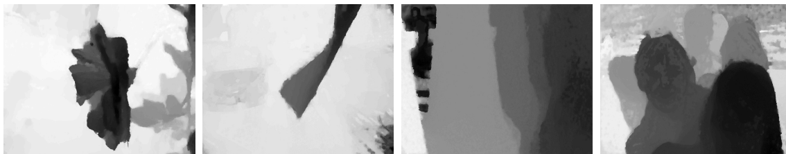
Figure 3: An example set of top-left view disparity maps used in our experiments

To evaluate our proposed spatio-angular prediction method in the full coding scheme, we apply it on real light fields captured by plenoptic cameras from the datasets used in [12] and [13]. To avoid the strong vignetting and distortion problems on the views at the periphery of the light field, we only consider the 8 \times 8 central sub-aperture images cropped to 364 \times 524 in [12], and 9 \times 9 cropped to 432 \times 624 from [13]. Some of the light fields considered are shown in Figure 2. The full set of light fields considered for the test is: Flower2 , Cars , Rock and Seahorse from the dataset in [12] and StonePillarInside and Friends from the dataset of ICIP challenge 2017 and used in [13]. The method used to estimate the disparity of the top-left views is described in [11]. Examples of the disparity maps provided are shown in Figure 3. A sparse set of disparity values and the segmentation maps computed with SLIC [10] are used to construct local graph supports as described in Section 2. In our experiments, we fix the number of super-rays for all datasets to 4000. Indeed, an ideal segmentation for compression purposes, would be the result of a local rate-distortion optimization (as previously proposed in [14]). For the sake of simplicity in this paper, we use a simple non adaptive segmentation.