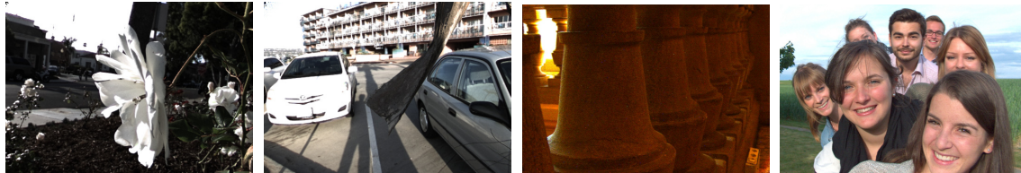
Figure 2: An example set of light fields used in our experiments. Only the top-left view is shown for illustration purpose. From left to right: Flower2 , Cars , StonePillarsInside and Friends .