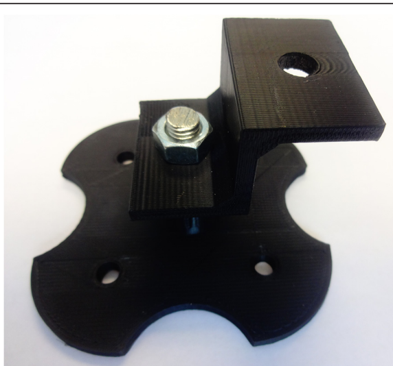
Figure 2 Assembled 3-D printed mounting bracket and standoff.

to their optimal tilt angle. As the size of the PV system gets smaller, the relative cost of the racking increases, so decreasing the cost of the racking can make smaller PV systems easier to afford for people looking to use them in apartments, or cottages that have lower electricity requirements compared to a typical household. It should be pointed out here that the RV PV system mounting is but a single example. Using the designs freely released for this project, many variations are possible for other applications. For example, flat roof and even tilted roof