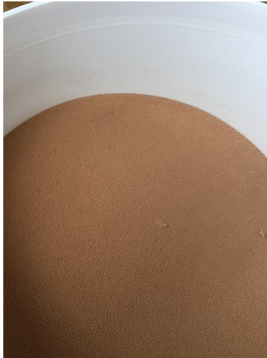
The Unibio food made from feeding natural gas to bacteria.

gas or other fossil fuels. And thanks to progress in food science, the resulting foods may even taste good.