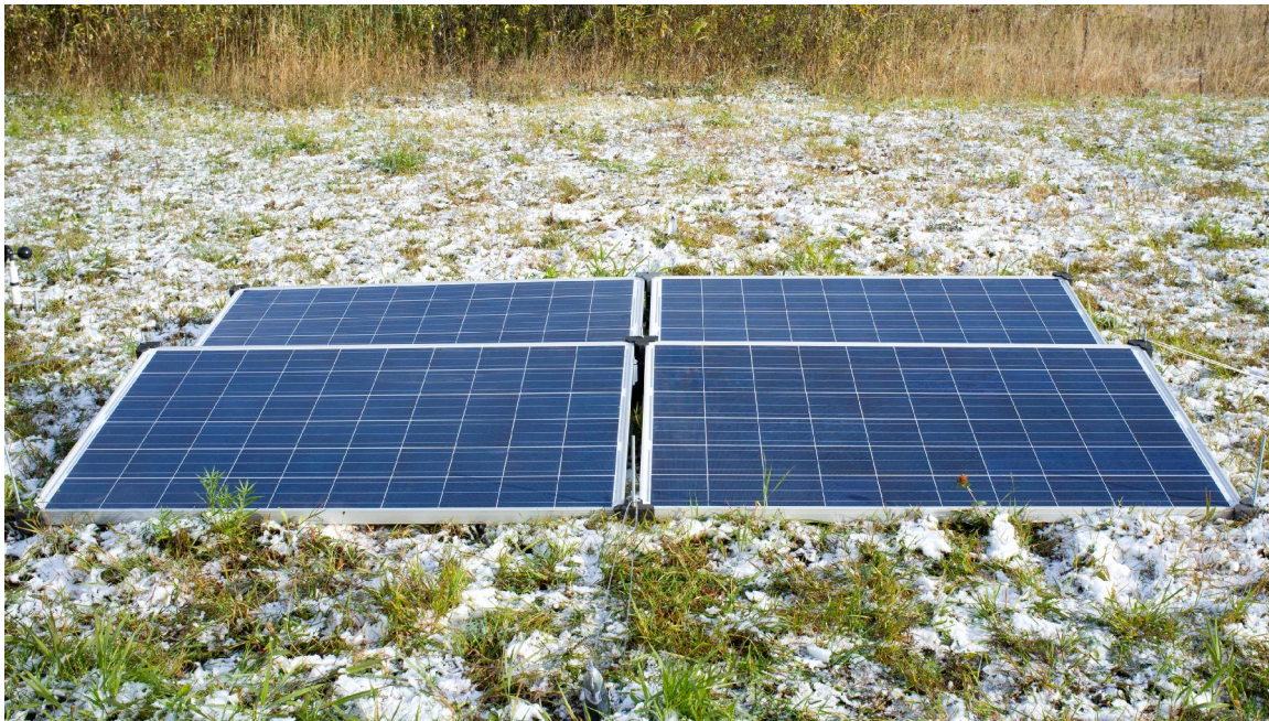
Figure 2: Assembled 1kW PV array with X-wire system. The 3-D printed

A 1kW PV array consisting of four 250 W PV modules, was successfully constructed, as shown in Figure 2, using the X-wire system. The array was deployed outside for the winter of 2013/2014 in the upper peninsula of Michigan and subjected to harsh temperatures and heavy snow loads as measured by the Keweenaw Research Center (KRC) (2014), where the system was setup. Once the snow fell the temperature at the level of the racking was between 19°F [-7.22°C] and 24°F [-4.44°C] for the duration of winter and had a maximum depth of snow of 39 inches [0.99 meters]. With a ground snow load of 100 lbs/ft 2 [488.2 kg/m 2 ] (Energy, 2010) an estimate of the snow load on the 10 degree tilted modules is 84 lbs/ft 2 [410.12 kg/m 2 ] (Ochshorn, 2009). All 100% fill parts remained in tact.