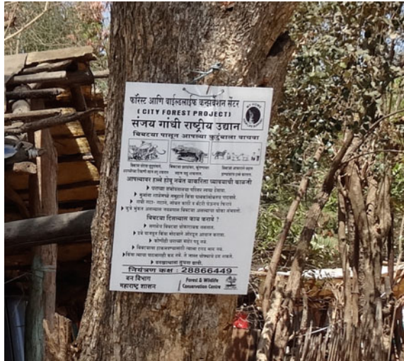
Photo 7.1 “How to avoid leopard conflicts. Do’s and don’ts in leopard areas” (Poster pasted in a tribal hamlet by the Forest and Wildlife Conservation Centre)

What we see here, therefore, is the emergence of an ambiguity linked to urban sociopolitical structures. In principle, the majority of the middle class or wealthy urban populations share a “naturalist” ontology, based on the modern dichotomy between nature and society—in this case, between park and city. For Mumbaikars, apart from a recreational area open to visitors, an urban national park should be less “urban” than “national”, and above all “natural”. So leopards have no legitimacy outside the boundaries of the park, for reasons of safety of course, but also because these animals have their territory in the sphere of nature, not of the city. In Mumbai, with the exception of a few activists mostly from the middle or wealthy classes, the majority of the population—both rich and poor—seems to have little attachment to urban (wild) fauna and more generally to the ecological project of the national park. In terms of ecological perspectives, the social contrasts are greater in Nairobi: whereas almost all the inhabitants of the Kibera shanty town seem to be frightened of wildlife, or at least not much interested in it, 13 those of the smart Karen district include plenty of households favourable to nature conservation and attracted to this very green area by the very proximity of the park and the prospect of seeing wildlife roaming free.