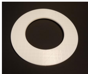
Figure 2. Example of flexible 3-D printed automotive related part, 2" gasket—shown enlarged for clarity.

The results of the 3-D prints with flexible filament were tolerable with a standard successful print for each print job as judged by function. Cura Lulzbot edition has predefined settings for NinjaFlex and these presets were used in order to represent the mostly likely printing settings by inexperienced consumers. The use of presets makes it straight forward for beginners to get started printing flexible objects. With the “quick print” settings enabled, users select the quality to be either high detail, normal or high speed. These selections mostly effect layer height and was altered on larger items like the hammer ergonomic grip, which was made with large layers to reduce printing time. The printing parameters that had a large effect on the end part was shell thickness and infill percentage. For the automotive related parts like the O-rings, gaskets and belts, the parts were printed with thick shells (1.2 mm) and low infill (20%). This provided an overall strong part with more flexibility. Shown in Figure 2, as a representative print, the average visual quality of the part was excellent.