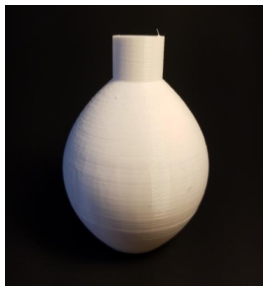
Figure 5. Example of medical device component: newborn medical ventilator bag.

Finally, the medical device in Figure 5 was printed at 50% infill with thinner shells because it needed to be robust and strong, but still flexible and light. This is another large print that was printed at a slightly lower layer height (0.25 mm). The print worked well and had only a light amount of stringing on the inside of the part itself that did not interfere with the functioning of the component nor impact in aesthetically.