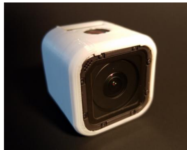
Figure 4. Example of product accessory, GoPro Session Camera Case.

of the detail users can still maintain, which is similar to harder thermoplastics when printing with flexible filament.