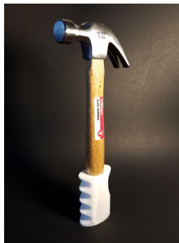
Figure 3. Example of household item, hammer ergonomic grip.

For household parts like the hammer ergonomic grip, thinner shells and less infill gave parts a soft and comfortable feel. Shown in Figure 3, the overhangs in the finger grips printed perfectly. This is an example of a large part with large layers (0.4 mm) to reduce printing time. Even with the visible layers, the part appears aesthetically acceptable.