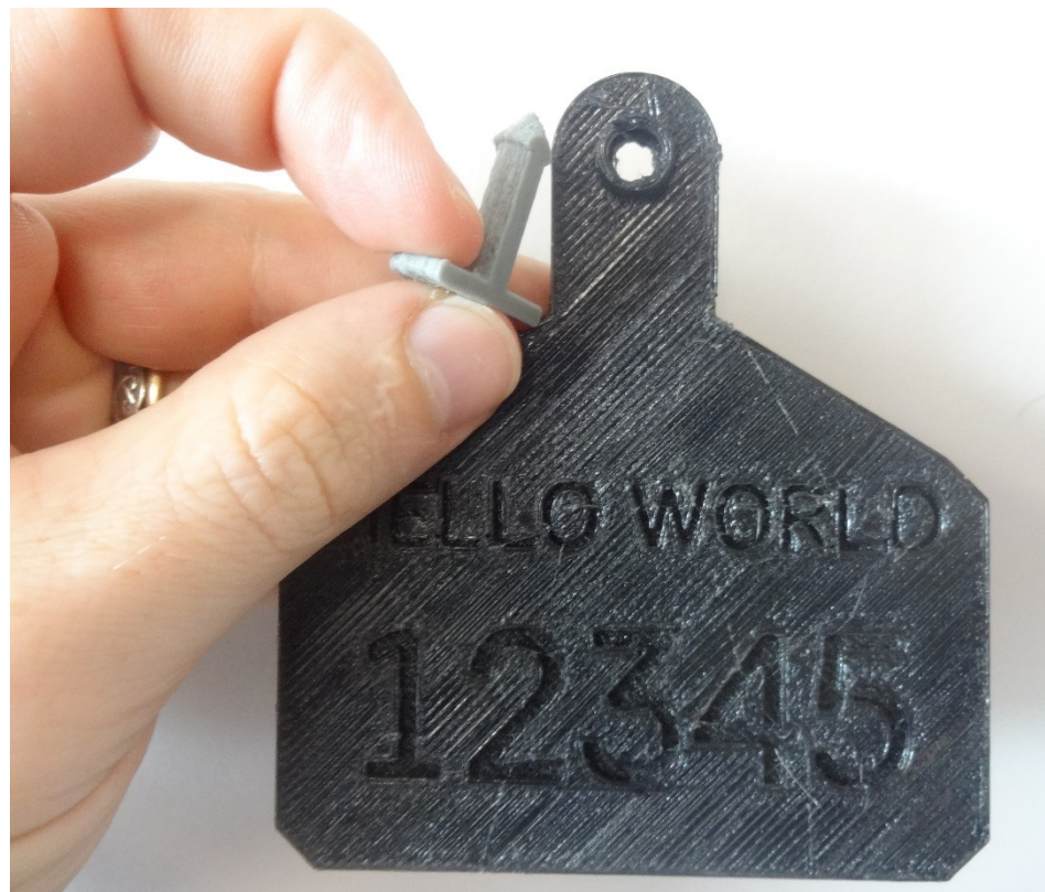
Figure 2. 3-D printed ear tag. PLA is in grey and ninjaflex in black.

The ear tags were successfully fabricated with 3-D printing as shown in Figure 2.