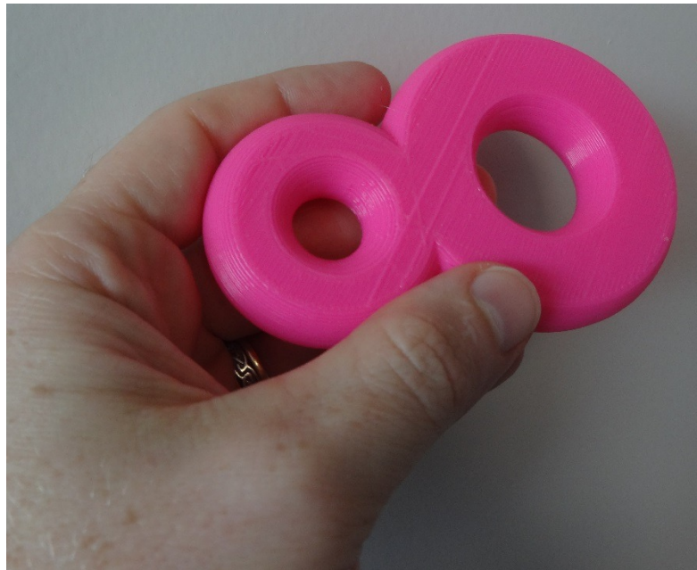
Figure 4. Lasso accessory – fully parametric and able to be customize, size and color.

A parametric customizable lasso accessory successfully 3-D printed. The exact weight will depend on the infill and the custom dimensions. Here the default printed in low-resolution on a TAZ-mini is 27.3g and is shown in Figure 4.