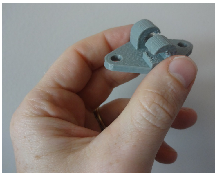
Figure 3. 3-D printed electric fence insulator.

A parametric customizable electric fence component was successfully designed and printed in PLA, weighing 4 g as shown in Figure 3.