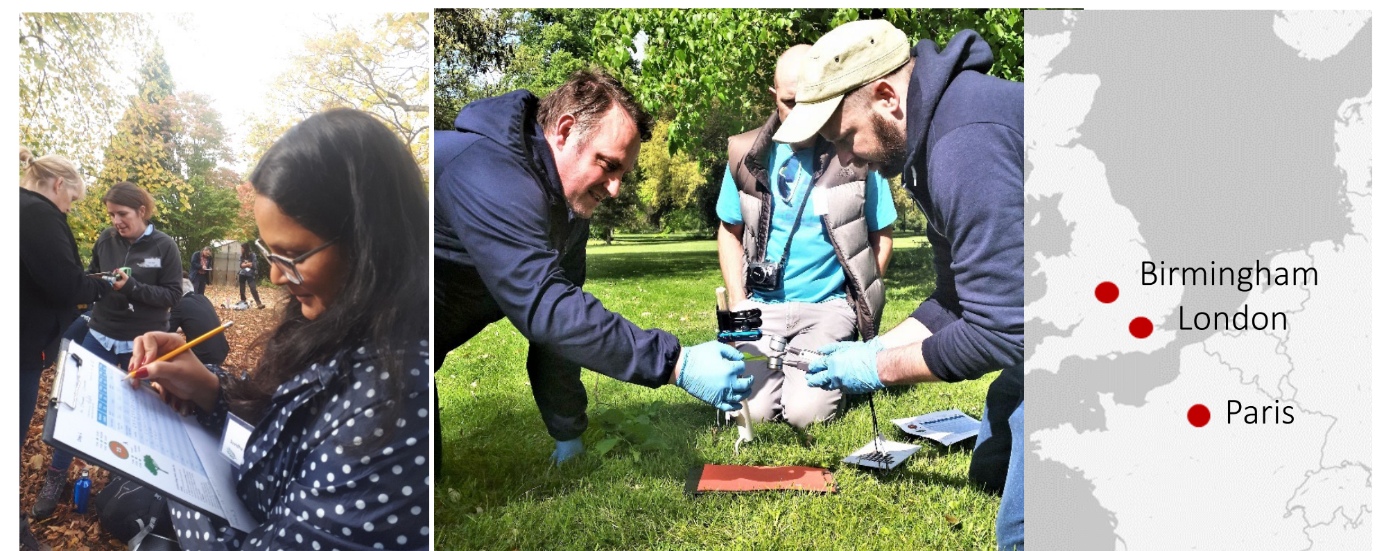
Citizen scientists collecting key environmental and tree data