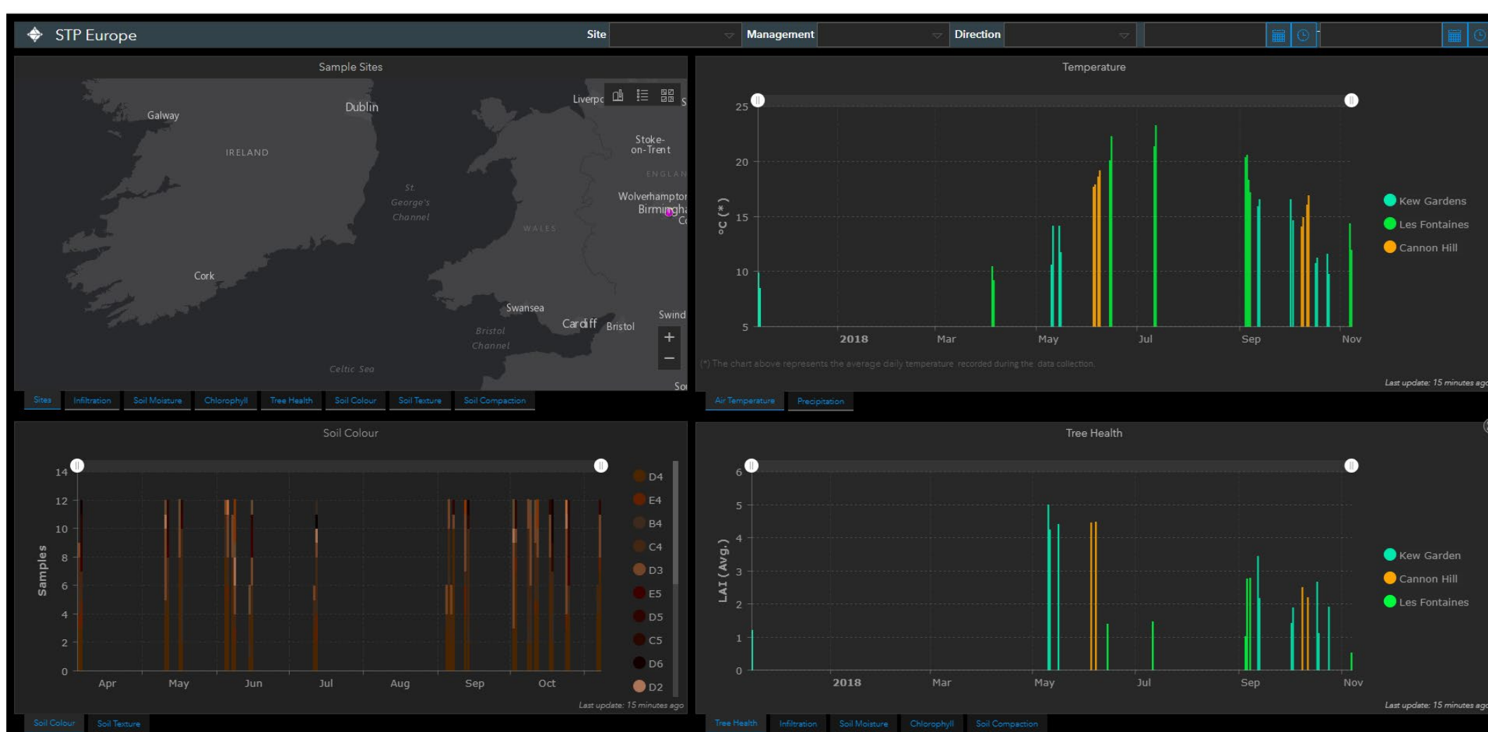
The online database collects and displays results in real time.

Research datasets collected by citizen scientists at each event are compiled in online datasets that can facilitate identifying patterns of land use and the benefits for green infrastructure.